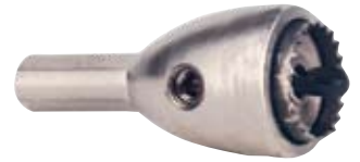
X-Act™ Hole Saw U.S. Patent No. D377,495

Many cable assembly combinations available. Call for information.