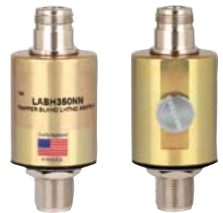
Trapper™ Lightning Arrestor