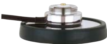
Magnetic Base Rubber Boot