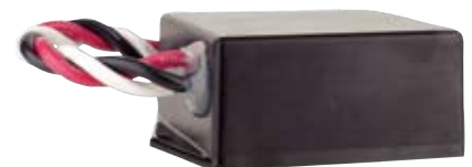
Blackhawk™ Noise Suppressor